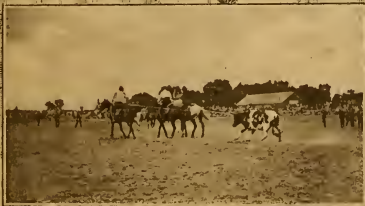
DRAGGING STEER TO CORRAL.